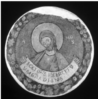
One of the frescos to be on display.